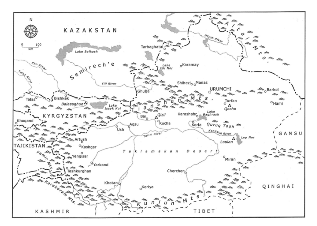
FIGURE 10.1 The Xinjiang Uyghur Autonomous Region

regions in the world. It is also the gateway to the Silk Route, through which China not only exports to Central Asia and the Middle East, but also imports oil and gas for its economic development. Right now, China's major foreign policy initiative is the One Belt and One Road Initiative. Xinjiang is right in the middle, the hub of that infrastructure development plan.